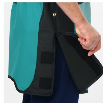
Hook and loop closure side slits