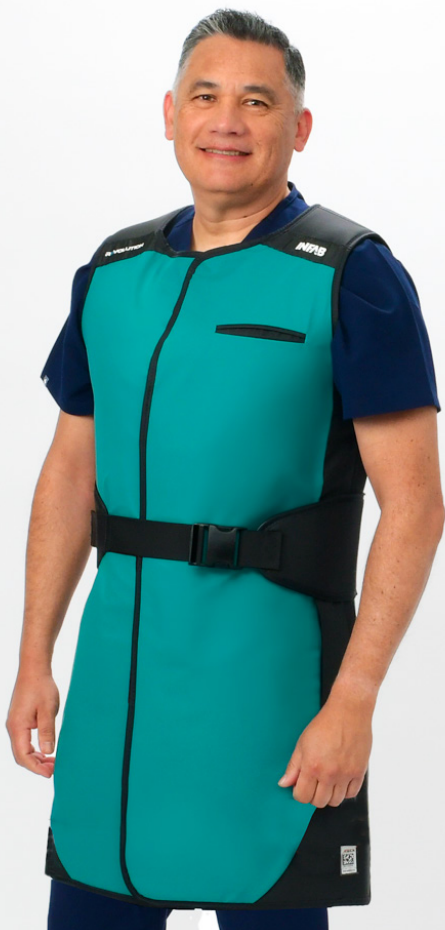
Shown in 506 Teal Black - Block