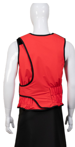
Shown in 601 Black/Red