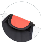
Left Surgery Drop-Away Shoulder Closure