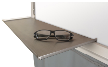
Optional 9"x 24" Stainless Steel Instrument Tray 076994-IT