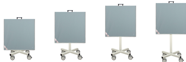
Adjustable height locking system from 37" to 56"