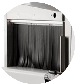
Food X-ray Inspection System Curtains