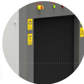
Luggage X-ray Inspection System Curtains