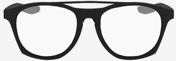
CURRENT-01 Matte Black